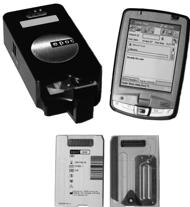
FIGURE 1. The EPOC system. The EPOC blood analysis system consists of individual test cards (front and back of card in lower half of figure) that can provide blood gas and electrolyte analysis in multiple configurations. This configuration uses a card reader (upper left) that detects signals from the biosensor on the test card and transmits the data wirelessly to a handheld PDA that contains the EPOC software to calculate analyte concentration from the raw card signals. Other configurations allow the card reader to wirelessly connect to PCs or other hardware running the EPOC software.

considering an EPOC purchase with an independent evaluation of device performance.